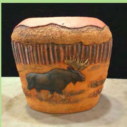
Moose Pot by Circe

Original Art Raffle— Buy your raffle tickets, then place your tickets in the box beneath the art work(s) of your choice.